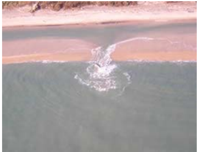
Rip Current in Florida after Hurricane Jeanne.

The June press conference was carried by Cable News Network (CNN) and Fox Network, with coverage provided by the Associated Press and USA Today.