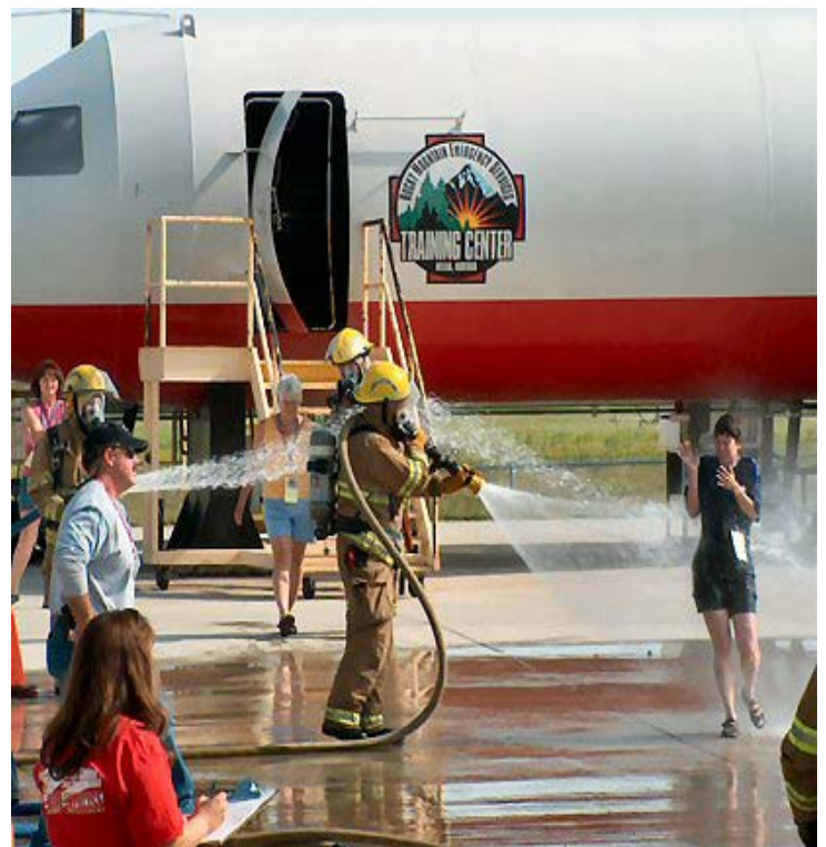
A "victim" is sprayed with decontaminant after being subjected to a biological agent released onboard a plane during Operation Last Chance in Helena, MT.

"A cold front and weak shortwave approached the area by late afternoon and convection developed over the Elkhorn Mountains by 2 p.m. Around 3 p.m. an initially weak cell moved into the valley and intensified as it moved over the incident location around 3:15