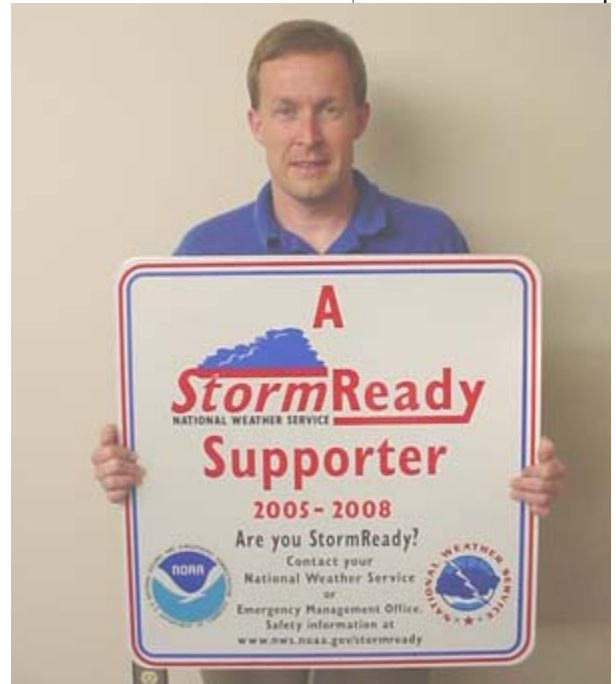
NWS now offers the option of s StormReady Supporter sign as well as the community and county signs.

Huntsville staff members plan on continuing the StormReady Supporter project throughout their 14 counties, specifically targeting large factories, universities and other significant partners, including media, within each of the counties. ❄