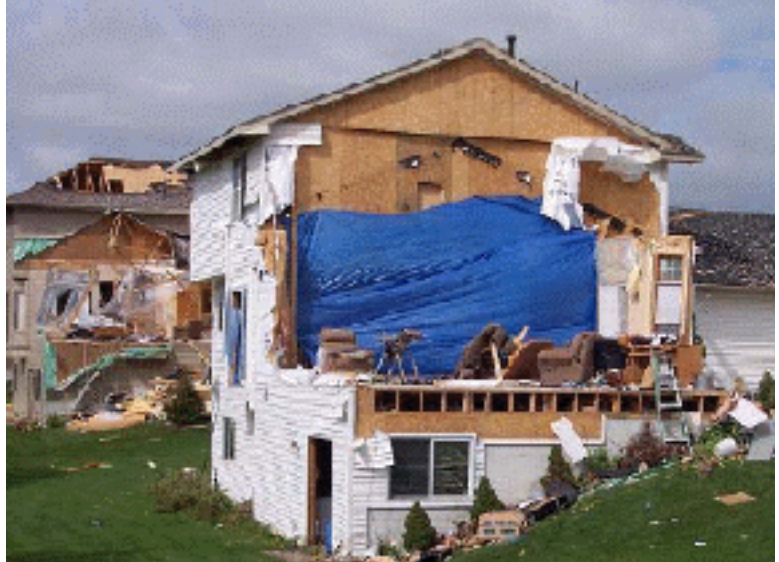
Rogers, MN, Tornado. Damage caused by a tornado on September 16, 2006.

A number of enhancements currently planned for NWS WSR-88Ds might have helped in this event. The enhancements of faster volume coverage patterns, dual polarization, super resolution and 3-D displays may have allowed the staff to issue a Tornado Warning sooner. Access to local FAA Terminal Doppler Weather Radar Data could also have provided valuable information. These enhancements might have allowed for more lead time but, even if they were in place, a Tornado Warning with enough lead time to help prevent the fatality would have been difficult. ❄