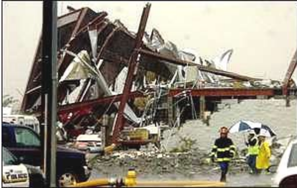
Fun Zone Skating Rink and day care center destroyed by an F2 tornado in Montgomery, Ala.