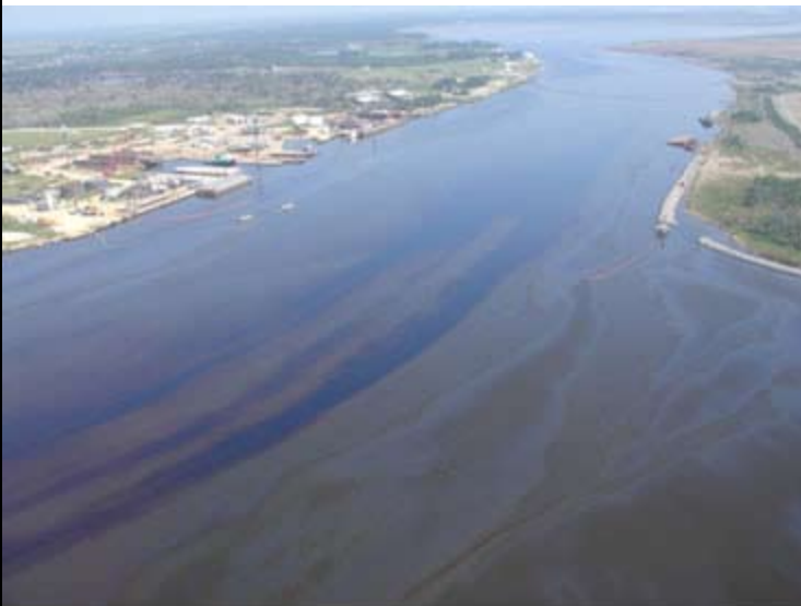
Aerial view of an oil spill on the Calcasieu River in southwest Louisiana on June 25, 2006.

The WFO issued more than 300 HAZMAT Spot Forecasts throughout this period to support hazardous incident clean-up and recovery. For more information about these events, visit the WFO Lake Charles Website at www.srh.noaa.gov/lch/ .